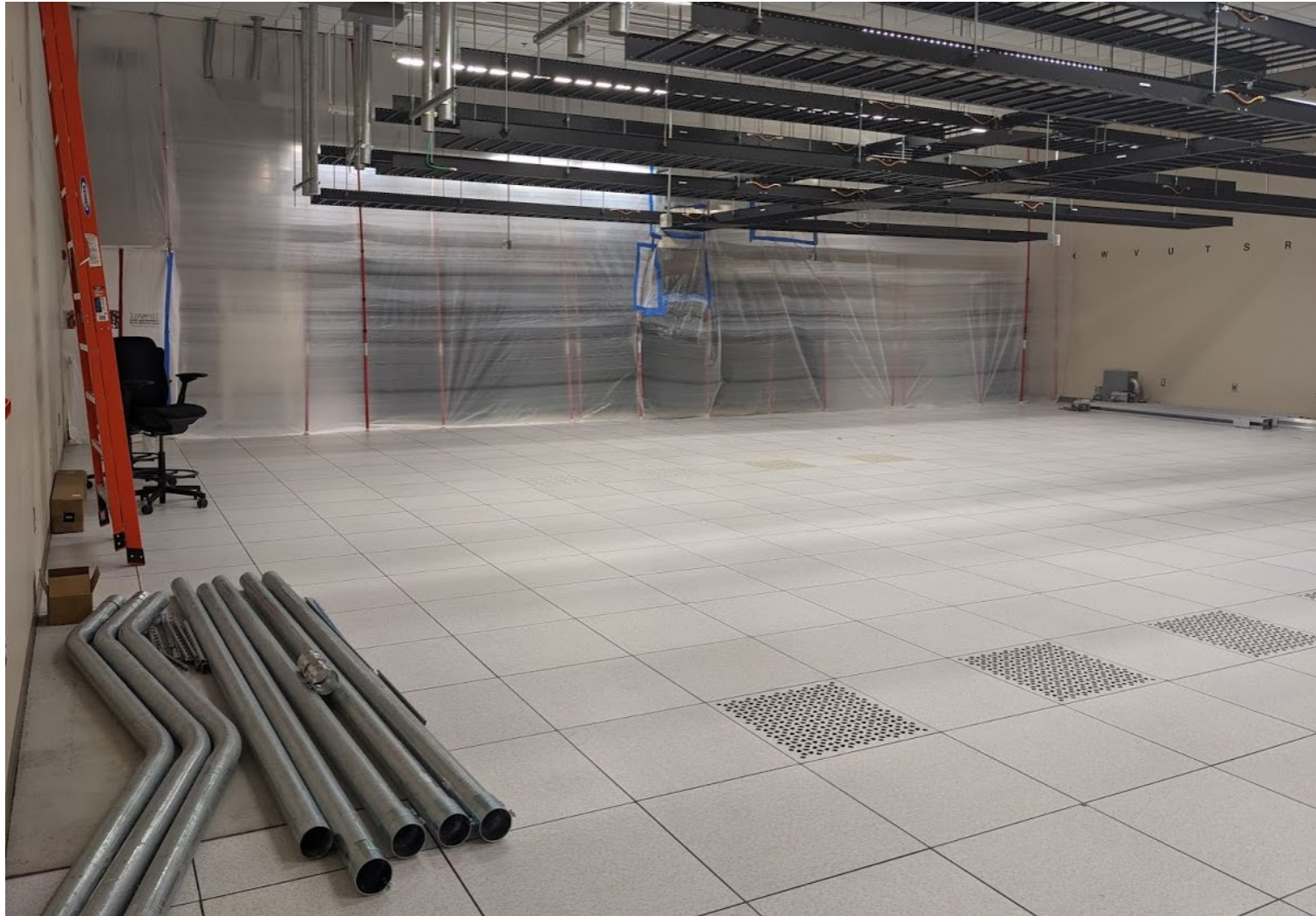
Contamination Partition in Data Hall 2